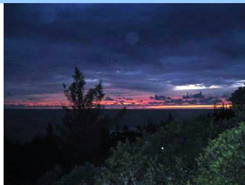
Sunset along the South Shore